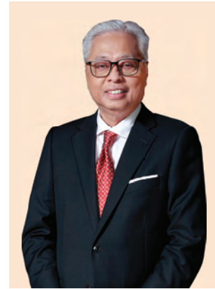
PRIME MINISTER MALAYSIA

The COVID-19 virus, which began in March 2020, has continued to disrupt lives and livelihoods through waves of new infections globally, necessitating the reinstatement of containment measures to prevent its spread. Malaysia has been no exception. The Government had to declare a temporary state of emergency, followed by a nationwide lockdown in the middle of the year. The objectives of these measures centred around saving the rakyat's lives and relieving the pressure on our public health system. The enforcement of various control measures such as domestic and international travel restrictions as well as the prohibition of operations for contact-intensive services industries have affected most economic sectors. Consequently, the GDP growth forecast for 2021 was revised downwards to between 3% and 4%.