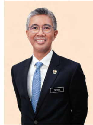
MINISTER OF FINANCE MALAYSIA

COVID-19 has been most disruptive to our lives, even as the nation enters into its second year of the pandemic. Thankfully, the Government's vaccine administration coupled with accommodative and substantial fiscal support have helped contain unemployment, keep businesses afloat and feed the vulnerable in the past 19 months.